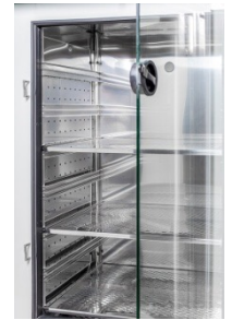
Interior glass door