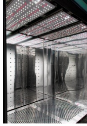
Detail: lights on shelves