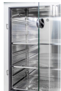
Interior glass door