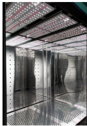
Detail: lights on shelves