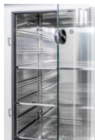
Interior glass door